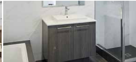
DESIGNER SINGLE VANITY