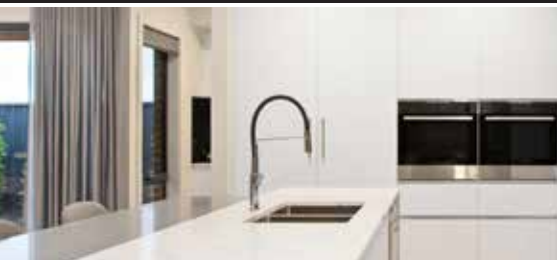
EUROPEAN STYLE FLICKMIXER TAPWARE THROUGHOUT