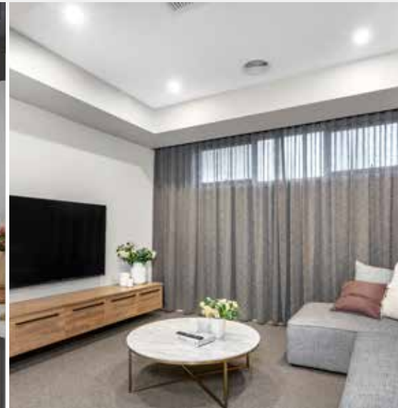
REVERSE CYCLE SPLIT SYSTEM