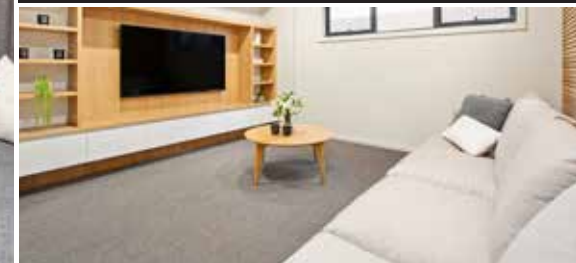
LOOP PILE CARPETS