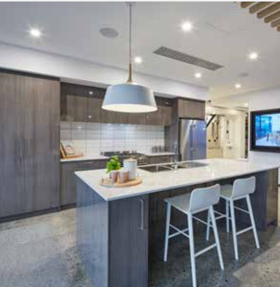
STONE BENCH TOPS, BREAKFAST BAR, OVERHEAD CUPBOARDS AND MUCH MORE