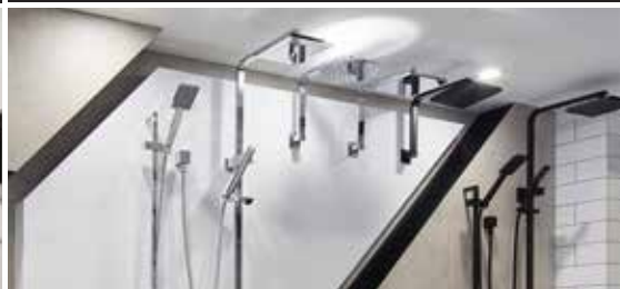
EUROPEAN STYLE SHOWER HEADS